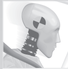
Crashtests nach ECE R44